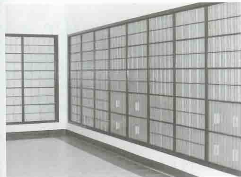
Rows and rows of rented mailboxes

As Father was pulling out of the parking lot, Simon pointed to the large blue box in front of the post