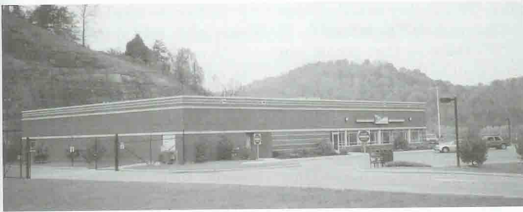
A community post office

shelves with different kinds and sizes of envelopes and boxes that were for sale too. Father took the parcel to the counter, and Simon watched as the clerk weighed it.